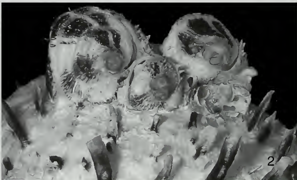
Fig. 2. Close up on the specimens of Chama aspersa Reeve, 1846. Left specimen 20 x 18mm, central specimen 13 x 10mm, right specimen 17.5 x 15mm.